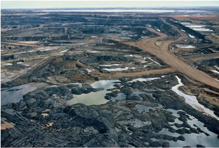
Alberta Tar Sands

Are we tough enough to handle a much simpler lifestyle in order to save one of the world's largest sources of pristine fresh water?