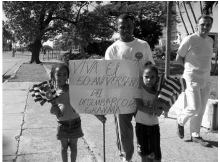
Parade pics above^

NB – In this first page opening part of the constitution there are five links to major addendum and sub-addendum to the act. We can't even get past the title without being redirected. I know that laws are sometimes necessarily complex, but this act is such an adaption of a collection of amendments of an ancient document written for another country in a far past time as to be a ridiculous joke. It is unavailable to the common Canadian, just the way those in power want things to be so that only a handful of lawyers and academic experts come close to understanding it and can help those in power retain that power and control of the “lesser” classes. • p.10