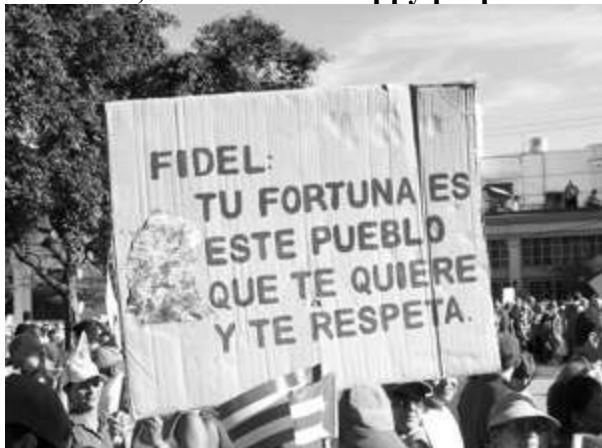
The youthful majority assembled at 7 a.m. and marched while the festivities were carried on national TV all day long.