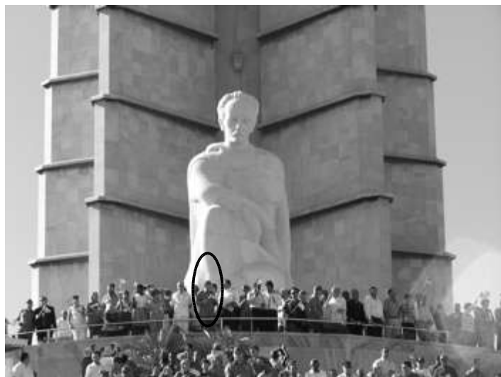
“Granma 50th - Raul Castro under the knee of Jose Marti

Che- Political Writings - Guevara's TV address to the people, Political Sovereignty and Economic Independence - March 20, 1960 . Part of the People's University televised live every Sunday at 9 starting shortly after the Revolutionary victory. The format was a presentation followed by an open question and answer period- see the discussion for 6 or 8 paragraphs after para 51 . This discussion was the first mention of the evils of Geopolitics or modern day Globalization & future USA Terrorism .(1960) •