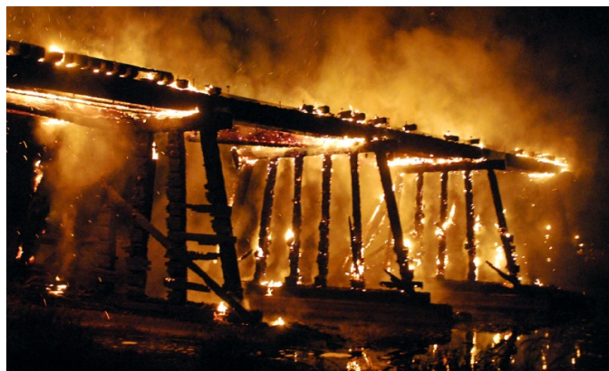
Kettle Valley BC

Now today, there are those in our family who worked and voted to get and keep Gordon Campbell's big business corporate Liberals in power; in the re-election of this cabal of thieves to power, despite BC Rail and other shenanigans, while other's of us worked to replace him with an intelligent, decent, man of the people. There can be no doubt that Gordon Campbell et al are already the worst thing ever to have happened to this province. The stench is already sickening. I find it's now time to burn bridges.