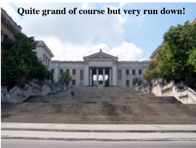
Quite grand of course but very run down!

My day starts of at 6:30, with a much needed shower, more like rinsing under a slow trickle, then a five block walk to the University where I stop outside for a fruit juice, or Jugo Fruta, a "scone" and a small shot of the strong sweet fresh squeezed coffee (not my general habit but when in Rome...)