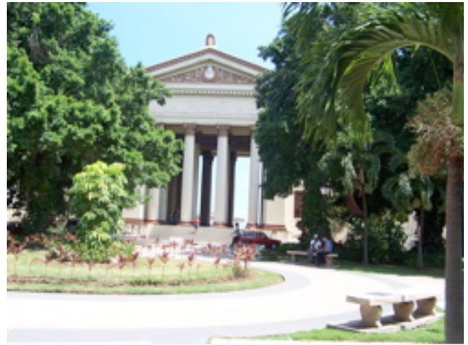
Edificio de Entrada - Habana University ▲

his government "but what can you do? The government isn't even elected anymore, it's bought and paid for by the corporations and arms industry!" I said, perhaps it's time for a student lead revolt. The US broke away from the repressive yoke of an Imperialist England in the beginning. The three of us had a long talk about NAFTA and how bad it has been for the poorer Mexican and Canadians. We spoke of