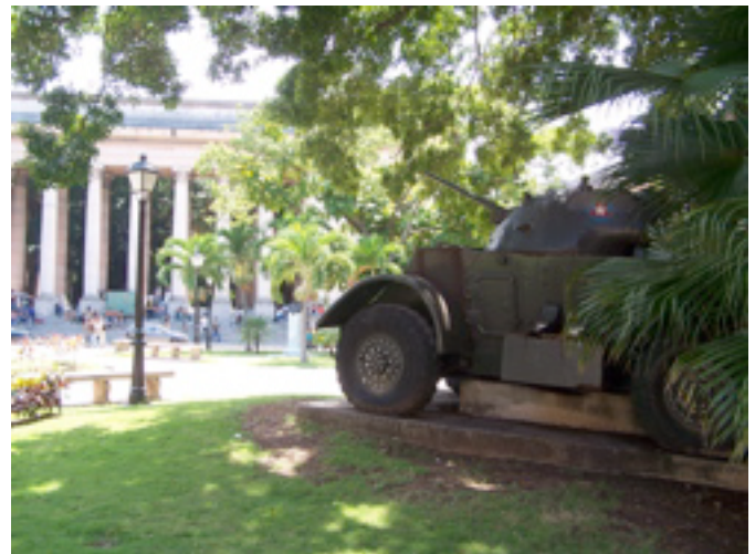
▼ Edificio de Lenguas da mia aula #13 ▼