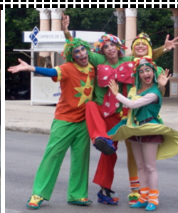
back to school Saturday parades!